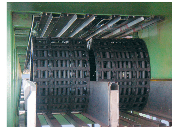
igus® system E4 with extension link on a ship loader for coal handling. Travel 105m, speed 240m/min, fill weight 53kg/m